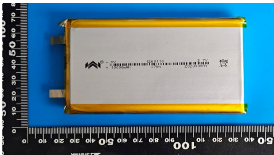
Fig. 4 –Sample nameplate