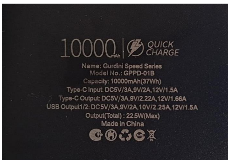
表4 – 样品铭牌