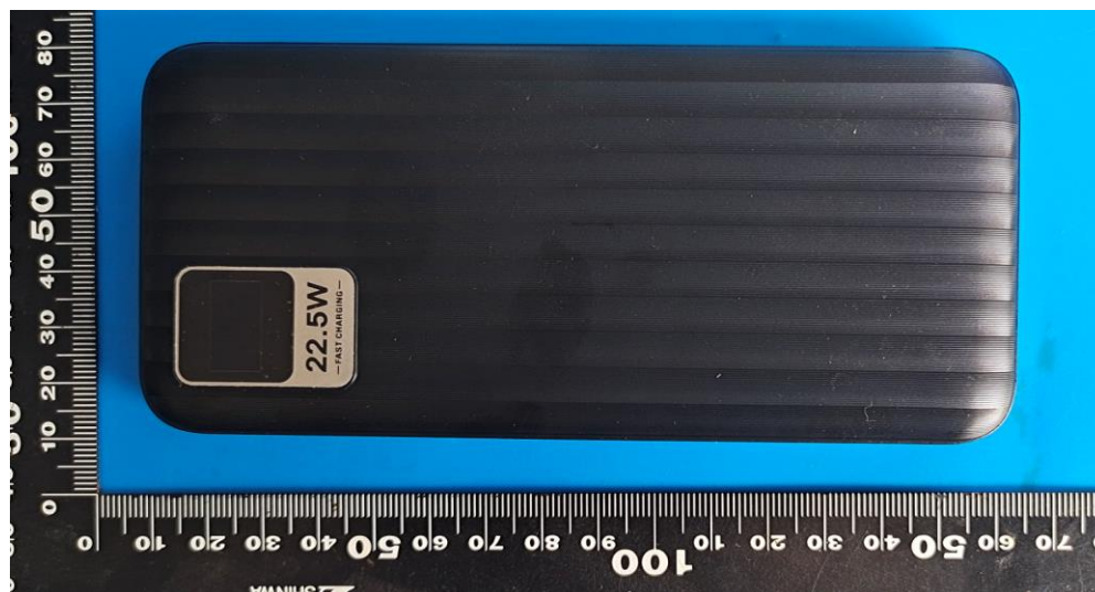
Fig. 2 – Back view of Battery 表2-电池反面视图