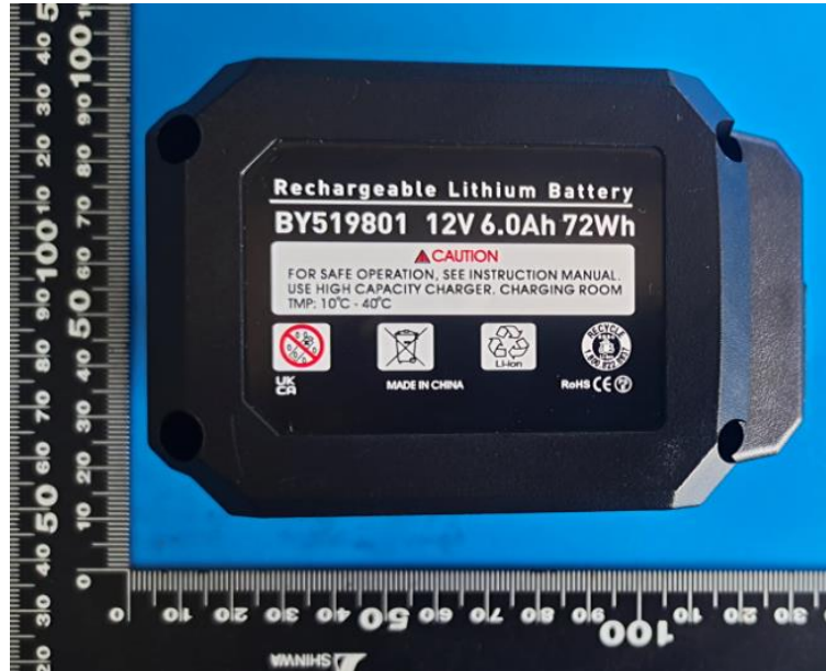
Rechargeable Li-ion Battery /可充电锂离子电池 (12Vd.c, 6.0Ah,72Wh)